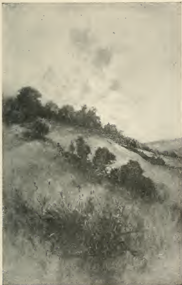
To meet the sun upon the upland lawn